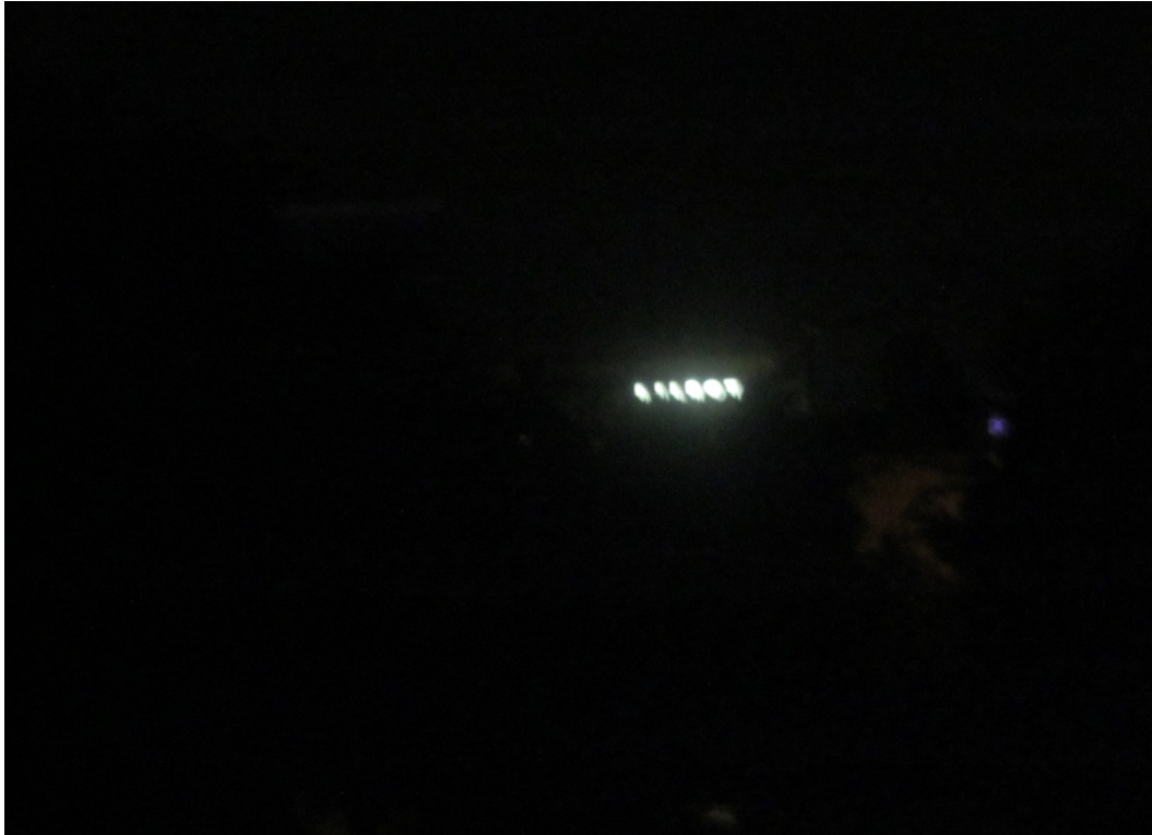
Westside Media Center (Olympic / Bundy): Kilroy sign facing south and shining into residential neighborhood.