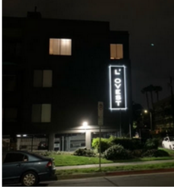
Apartments on Ayers and Barry: Lighted sign