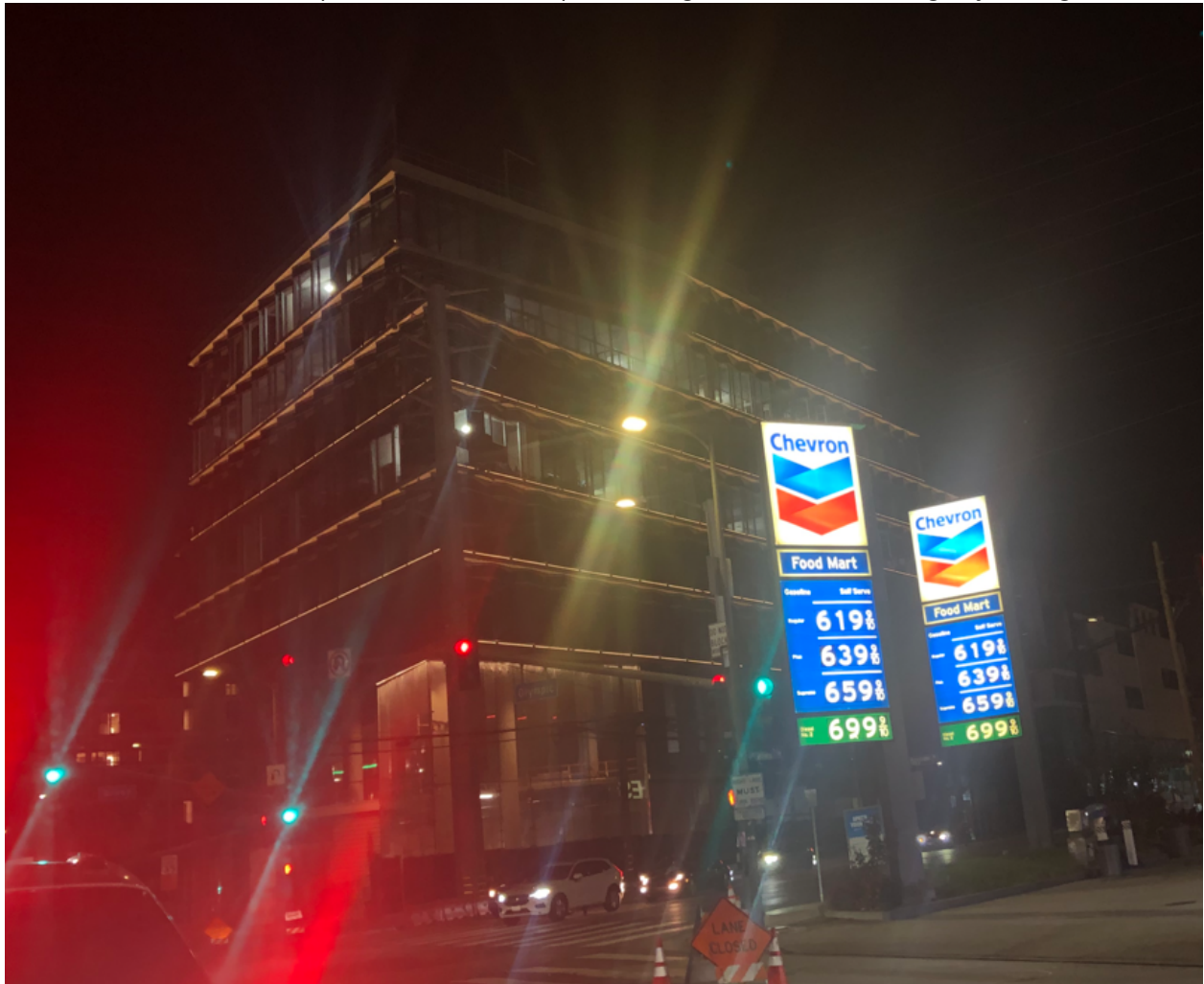
WestEdge project (Olympic Blvd., old Martin Cadillac site): Horizontal light bands that shine into houses to the south.