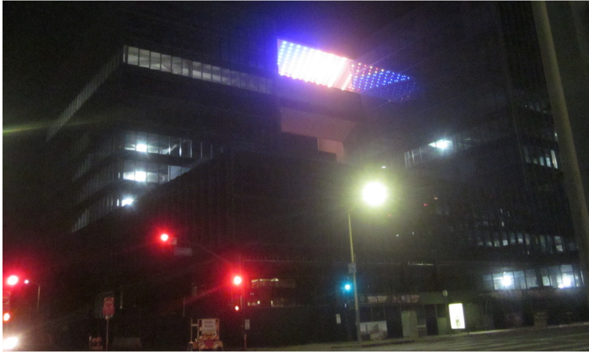
Lumen project (Olympic Blvd.): LED lights (colors, flashing) on bottom side of pavilion on roof that shine onto Olympic and houses to the north.