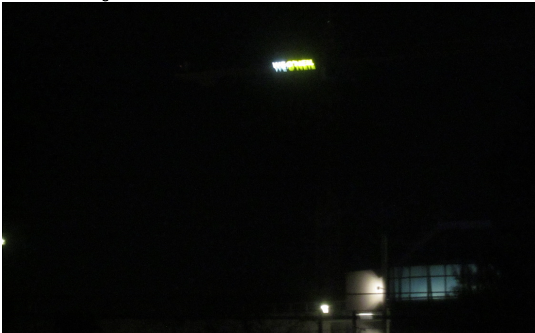
West Edge project (Olympic / Bundy): Construction crane facing south and shining into residential neighborhood (O'Neill Construction).