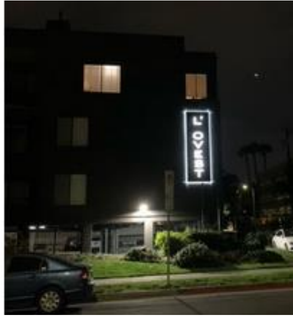
Apartments on Ayers and Barry: Lighted sign