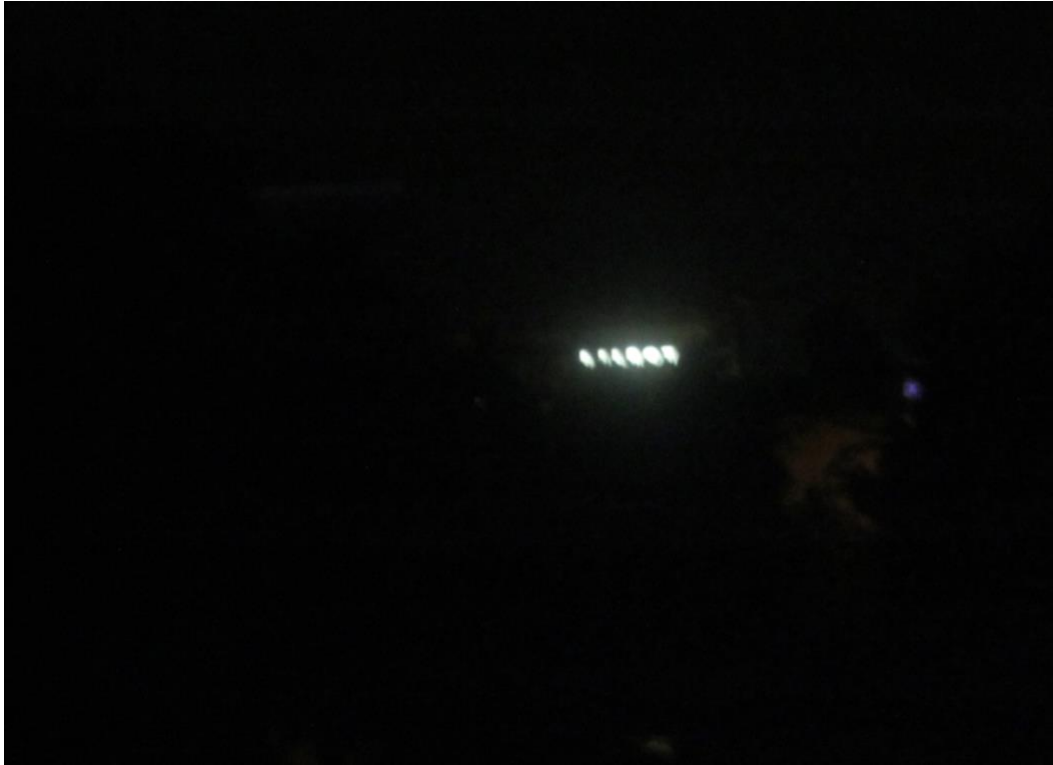
Westside Media Center (Olympic / Bundy): Kilroy sign facing south and shining into residential neighborhood.