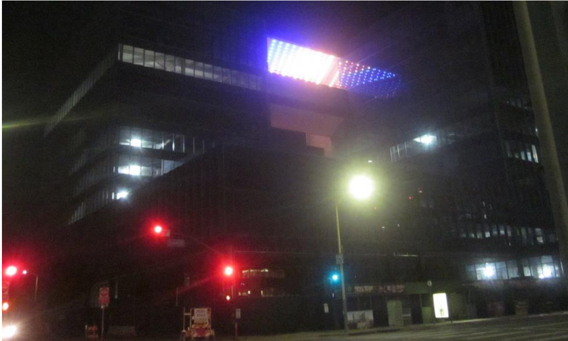
Lumen project (Olympic Blvd.): LED lights (colors, flashing) on bottom side of pavilion on roof that shine onto Olympic and houses to the north.