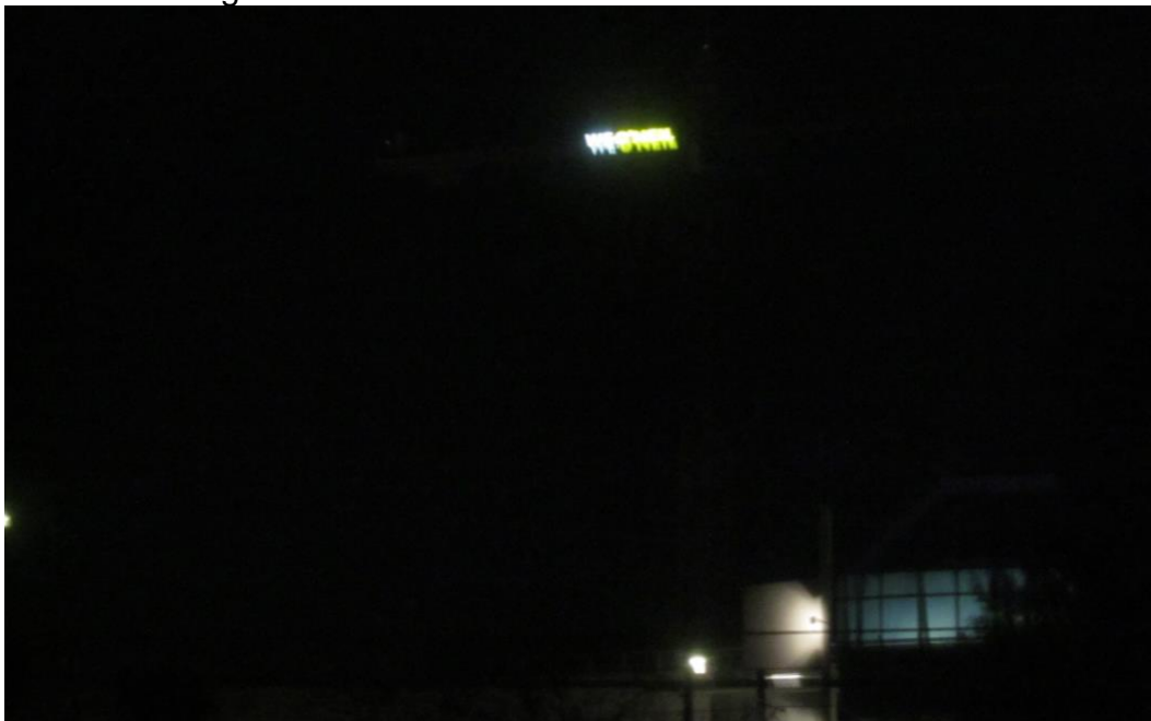
West Edge project (Olympic / Bundy): Construction crane facing south and shining into residential neighborhood (O'Neill Construction).