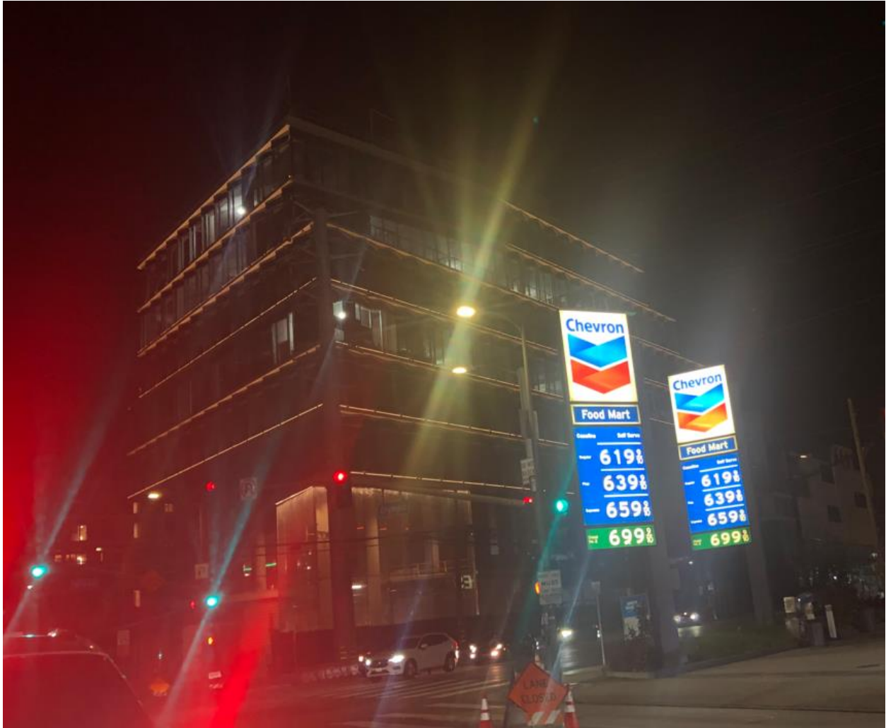
WestEdge project (Olympic Blvd., old Martin Cadillac site): Horizontal light bands that shine into houses to the south.